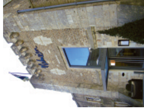
The new Malmesdon Hotel at The Oxford Castle opened in 2005.

A new planning application is due to be submitted by Capital Shopping Centres for the £300 million redevelopment of the Westgate Centre which will have John Lewis as an anchor tenant. The developers hope it will be open by 2010.