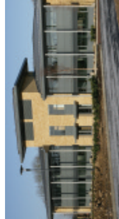
Wootton Business Park, Oxford. A new speculative office scheme comprising two units of 4,400 sq ft available leasehold or freehold developed by Hartwell plc.