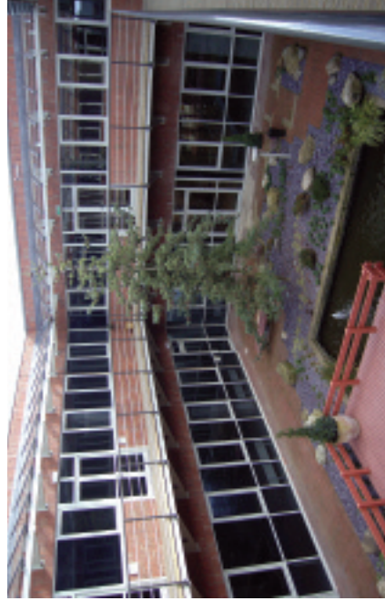
Windrush Court, Abingdon Business Park. Standard Life have undertaken a comprehensive refurbishment to provide office suites from 1,500 - 30,000 sq ft which completed in November 2005. Prelettings were agreed with XOU Solutions and Health Decisions in 2005.