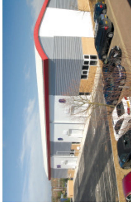
Isis Court, Abingdon Business Park. A new freehold scheme by Standard Life providing industrial units of 1,800 - 3,100 sq ft completed in 2005.