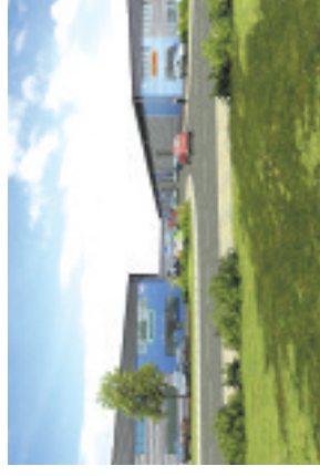
Windrush Park, Witney. A new small unit freehold scheme by Abacus Developments.

Over 200,000 sq ft of new speculative development is planned for 2006 , principally focused on small unit freehold schemes. Almost all of the schemes are on former industrial sites with the redevelopment of redundant buildings.