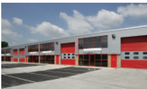
Nuffield Centrum, Abingdon. Refurbished units by ING. Lettings in 2007 included Sally Hair & Beauty, BSS, Southern Brick & Tile and Leeches Printers. Rents achieved between £6.50 and £8.50 psf

Available floor space decreased by 13% to 1,700,000 sq ft. There is now no Grade A accommodation available. Availability has decreased in all areas. Oxford Ring Road supply decreased by 60% to 111,000 sq ft; Banbury remained static at 200,000 sq ft; Bicester increased