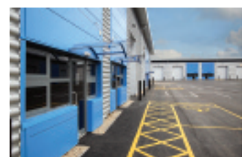
Nimrod, Witney. A small unit industrial scheme of 40,000 sq ft in Witney by Abacus Developments. 5 units sold prior to practical completion