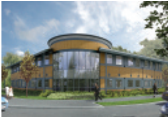
OX1. A proposed new landmark office building on Oxford Ring Road comprising 14,000 sq ft by Jewson Ltd