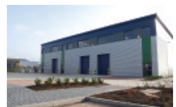
Chancerygate, Kidlington. A development of 20 new industrial units from 2,000 - 7,400 sq ft