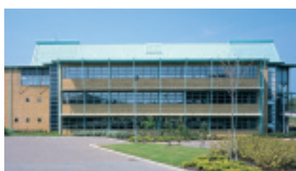
Torus, Abingdon Business Park, Abingdon. ABINGDON BUSINESS PARK

Second hand stock remains static at 740,000 sq ft. The supply of city centre offices continues to be very limited at only 22,000 sq ft and there is strong competition from occupiers keen to take any good quality space that is available here.