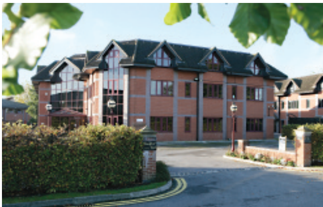
East Point Business Park, Oxford Road.

Refurbishment of five office buildings on the Eastern Ring Road comprising 73,000 sq ft by Frontier Estates plc. 9,000 sq ft let in 2007 to Carrier Group.