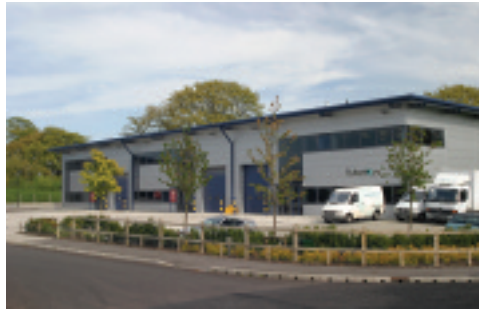
Oxonian Park, Kidlington. All units now let by VSL on behalf of SERGO with 2007 transactions to Walters OEP, Ridgeway Audi, Khatmandu and Oxford University Press

Witney also put in a strong performance with over 100,000 sq ft of take up at the Windrush Park estate mainly comprising secondary stock.