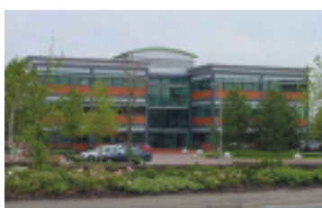
25 Milton Park. 16,000 sq ft acquired by VSL for Brookstreet Des Roches