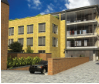
Eagle House, Oxford. A new development of 22,000 sq ft Grade A offices by Lucy Properties. A BREEAM rated 'very good' building due for completion by end of 2008