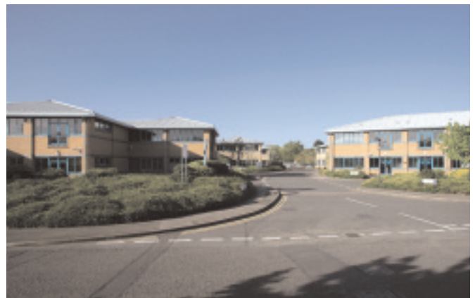
4-10 The Quadrant, Abingdon Science Park.

Refurbishment of five office buildings on the Eastern Ring Road comprising 73,000 sq ft by Frontier Estates plc. 9,000 sq ft let in 2007 to Carrier Group.