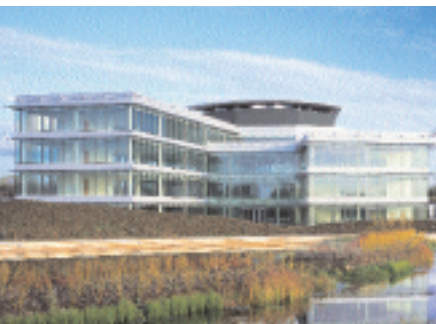
The Danby Building, The Oxford Science Park 55,700 sq ft headquarters office building available to let.