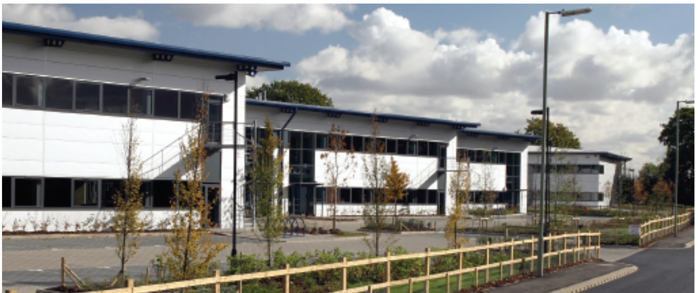
Oxonian Park, Kidlington.

The latest speculative industrial development in Oxfordshire is being undertaken by Land Securities and Albion Land comprising 12 units from 5,800 - 19,000 sq ft targeted at both hi-tech and the light industrial/distribution sectors.