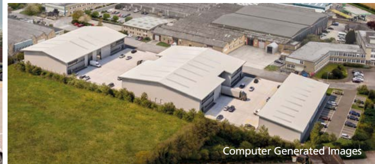
Computer Generated Images